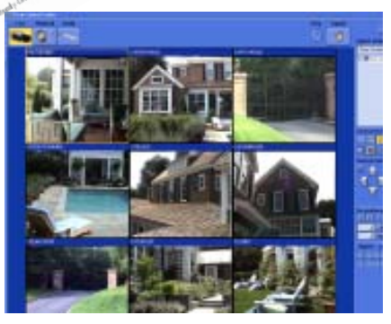
VIEWER SOFTWARE LETS YOU SEE CAMERAS FROM A REMOTE LOCATION (BROADBAND INTERNET CONNECTION REQUIRED)

Installed by Bri-Tech, a top-ranked provider of advanced security and communications systems for over 12 years, our engineers can design a methay . Digital Surveillance System for your home, which will meet your every need. Call us for a consultation.