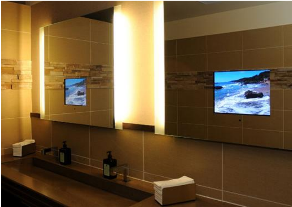
Enhanced Series Bathroom TV Mirror

A television with its black plastic frame never looks elegant in a fine space. Television Mirrors seamlessly incorporate beauty and technology. TV Mirrors are not new, however previous attempts killed the picture quality and brightness. The new generation uses special “developed for purpose” glass mated with a high performance television, making this concept elegant and impressive. When the TV is off, it is not visible; all you see is your reflection. Never again look at a plain TV hanging on the wall of your beautiful home or office!