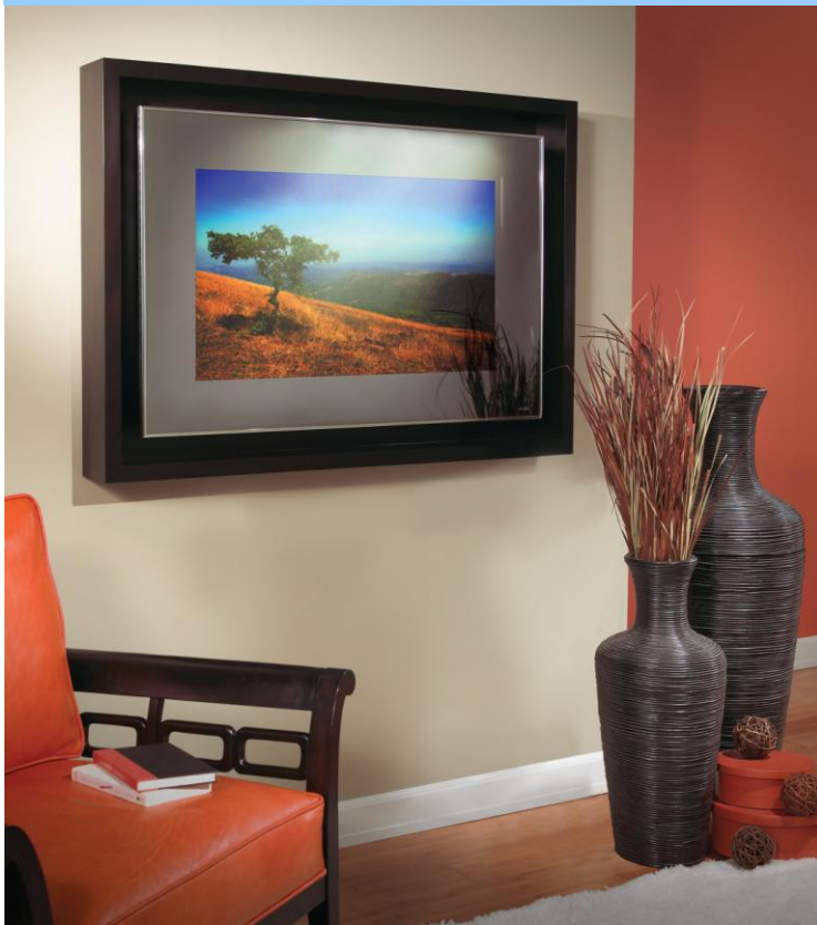
MODA TV Mirror