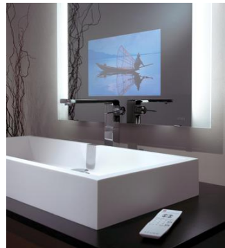
Enhanced Lumination Series